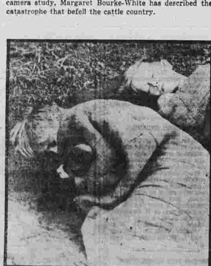
ESCAPE—A short-lived, blissfully cool down... then another oven-hot day.