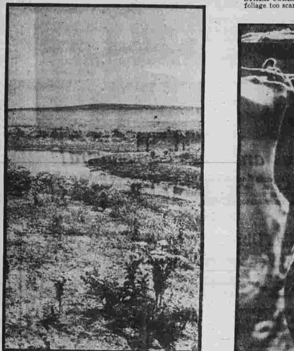
OASIS—A sun-baked river has become little more than a trickle of water... but welcome water, nevertheless, to starving and thirsting cattle roaming the powdery, denuded fields.