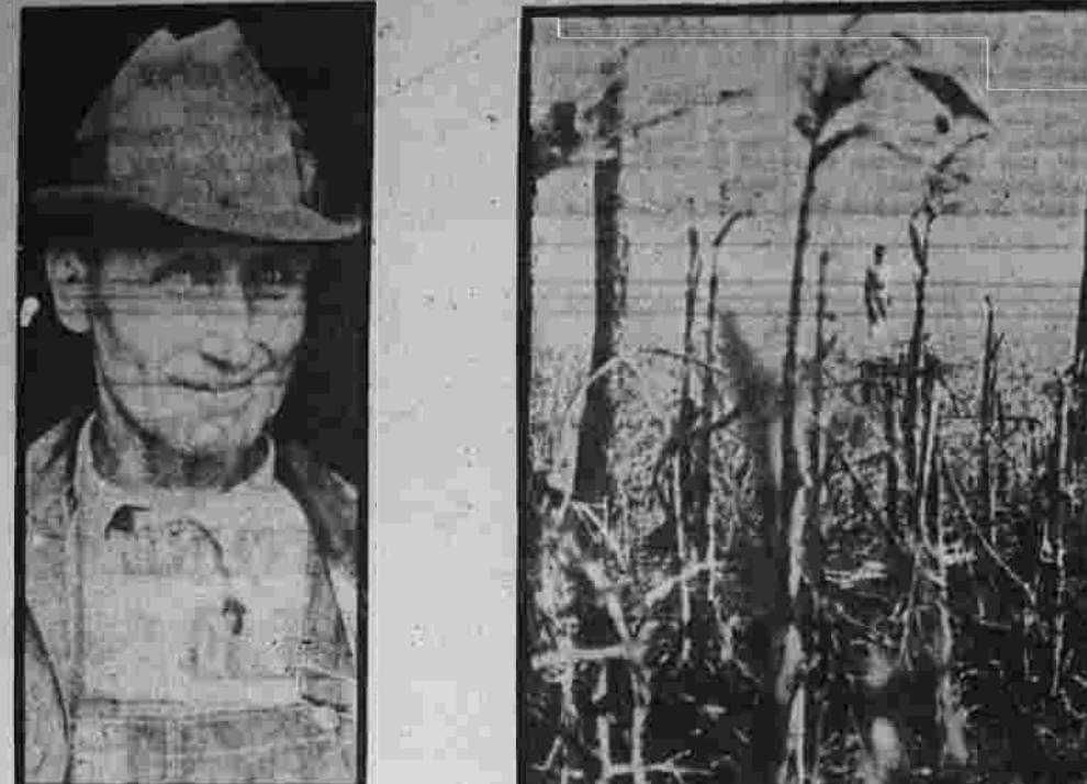
Rain—It's cloudin' up! Looks mighty like rain... And a smile stretches Mr. Farmer's leathery cheeks.

By Margaret Bourke-White, Famous Camera-Artist