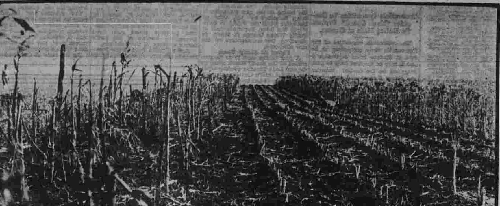
STALK COLLAPSE—Out where the tall corn didn't grow... sun-shrivelled stalks, farm-forests of disaster... foliage too scant even for fodder, as the Nebraska farmer who cut a row discovered.