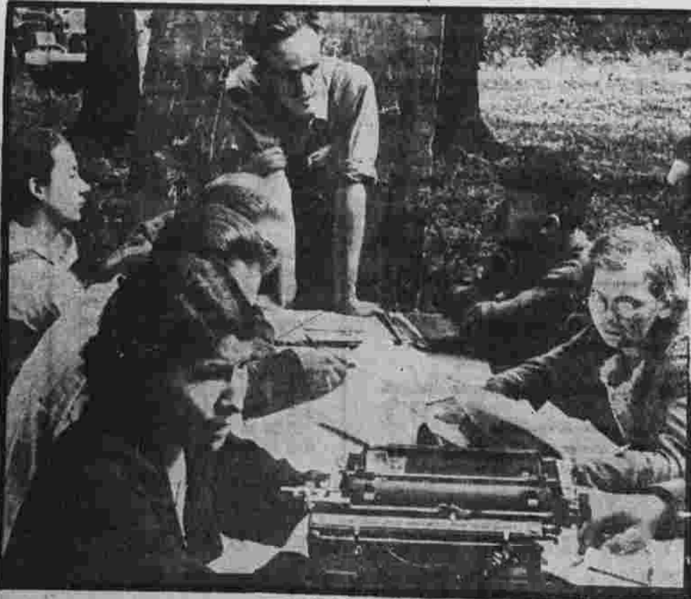
FARM PROBLEM—Tense, earnest faces... an automobile (visible upper left) has brought a Teacher to tell Dakota farm youths the "why" of disaster in the land.