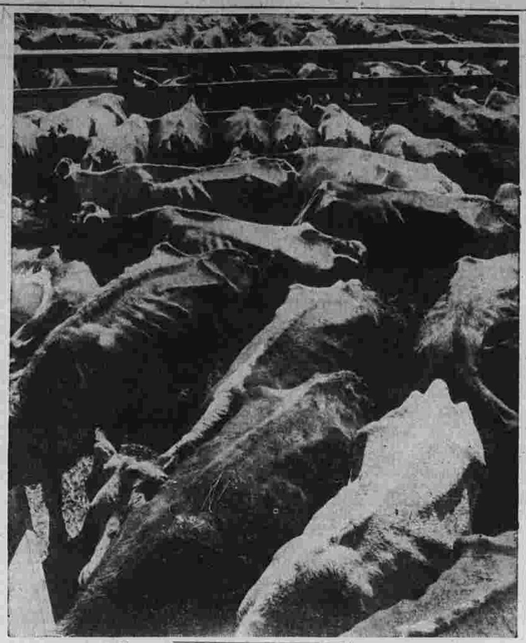
One of the Famed Drought Photos